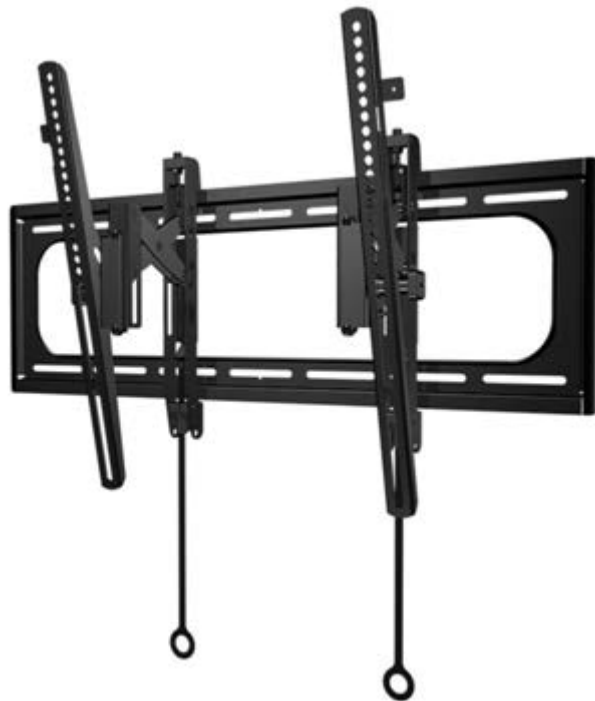
Sample Design of item 6 : Tilt type wall mounted TV bracket