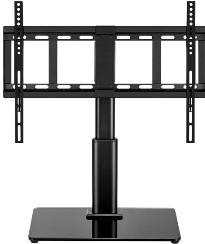
Sample Design of item 5: Floor mounted height adjustable TV stand