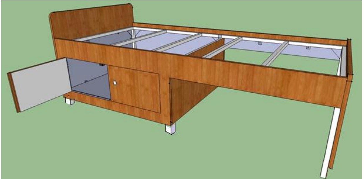
Fig. Representative model of the hostel bed (with cupboard)