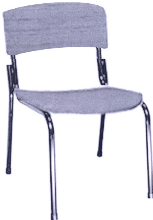
Representative figure of the Steel Frame Study Chairs for Students' Rooms (not to scale)